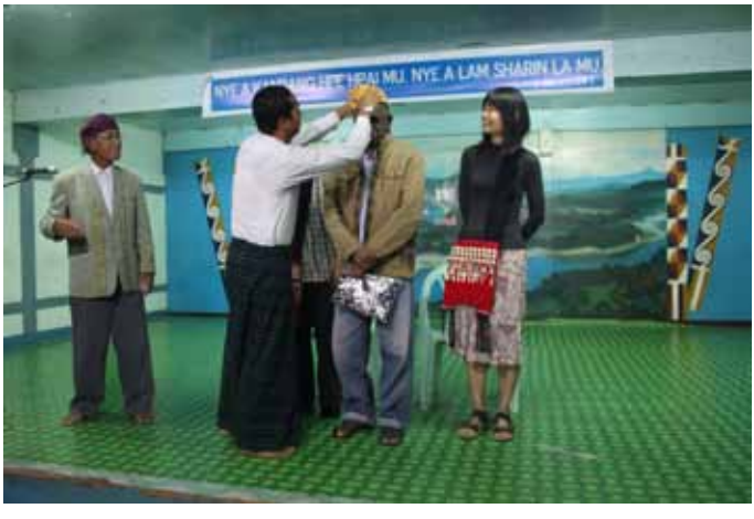
Offering Cultural gifts to the guests