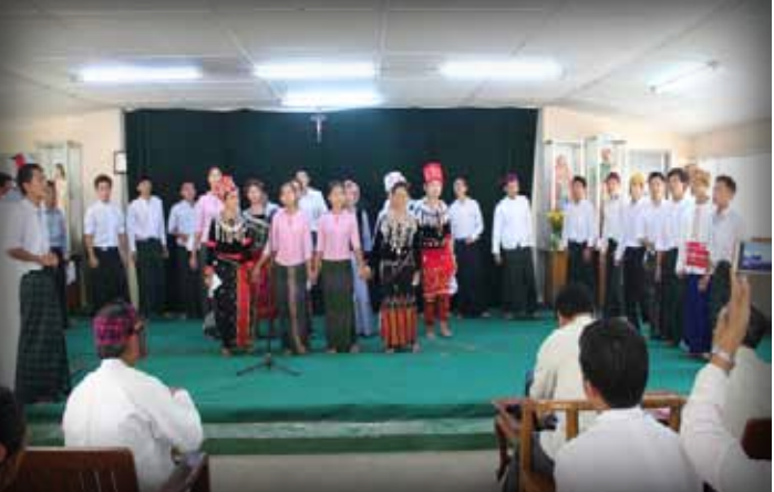
Mass celebration and meeting with Kachin Catholic Community in Yangon