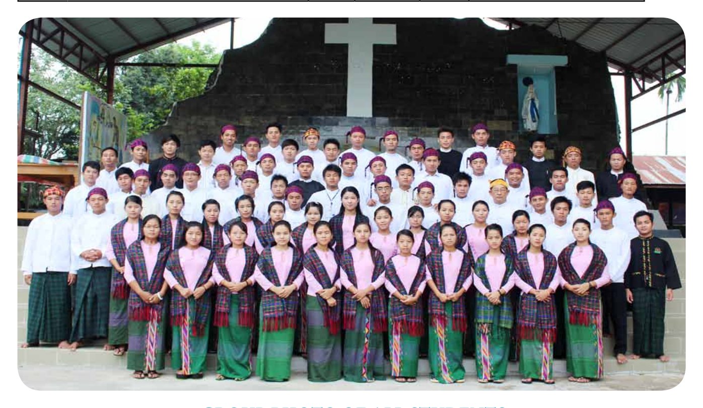
GROUP PHOTO OF ALL STUDENTS