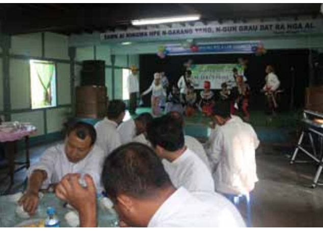
Presenting Cultural Dance on Mission Sunday

Inculturation event with the faithful community at St. Luke's College