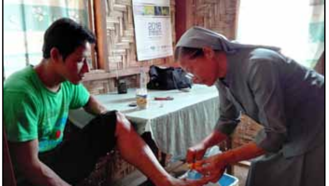
Students receive primary Health care and early treatment