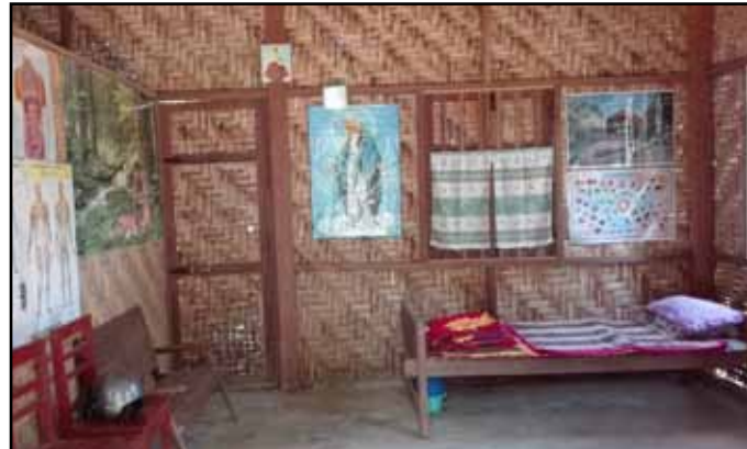
Clinic established inside St. Luke's college campus