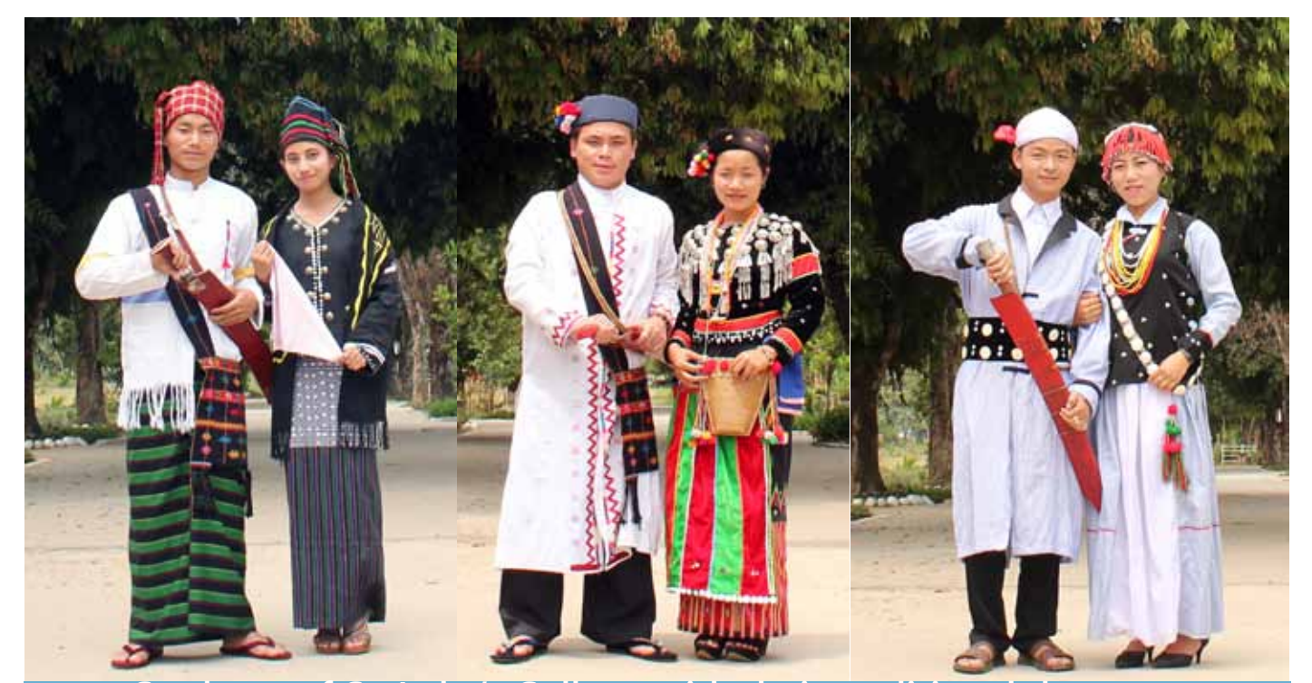
Students of St. Luke's College with their traditional dressess.