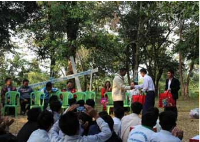
Home Christmas Celebration with Students and staff