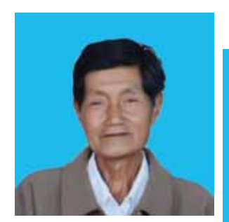
Slg. N Hkum Htoi Wa (Night Guard)