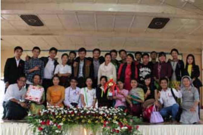
On world HIV/AIDS Day, Students won first prize on Daram Competition