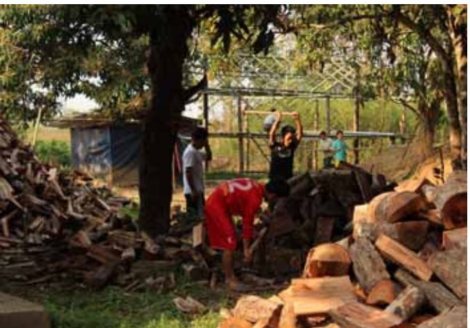
Cooks perparing for a meal