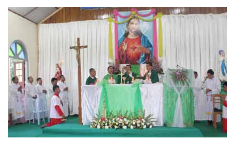
Eucharistic Celebration on Mission Sunday with Four Bishops