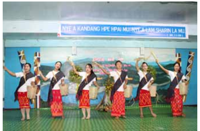
Performing cultural dances