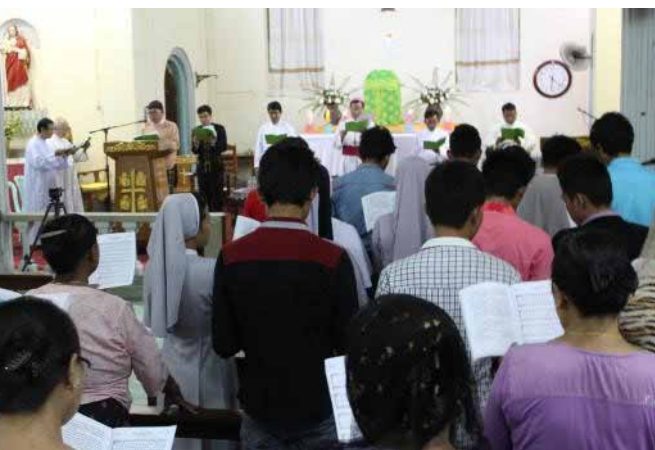
Peace for Kachin state and unity among different chruches prayer services at St. Columban's cathedral