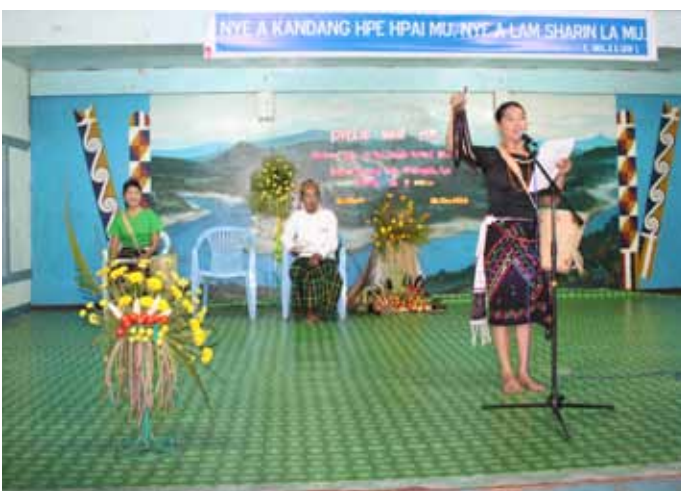
Students competition on Thanks Giving Day